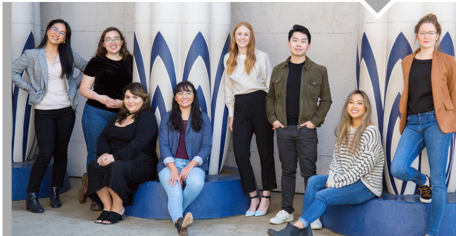
Steering Committee Members of genARTS, 2022