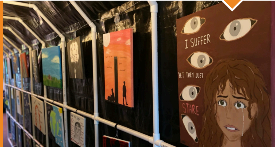
Project Mercy at Morgan Hill Charter School